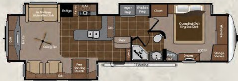
3800RE BIG SKY PACKAGE ELIGIBLE