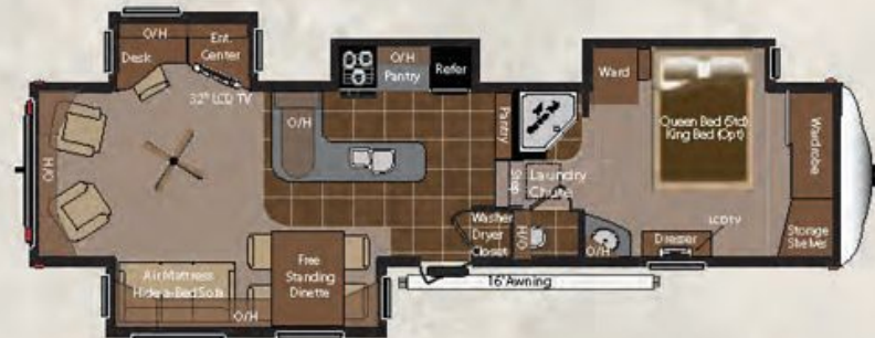
3400RL BIG SKY PACKAGE ELIGIBLE