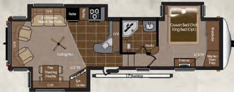
3100RL BIG SKY PACKAGE ELIGIBLE