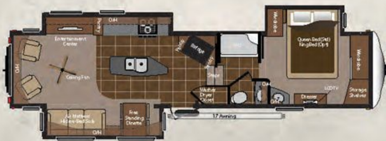
3582RL BIG SKY PACKAGE ELIGIBLE