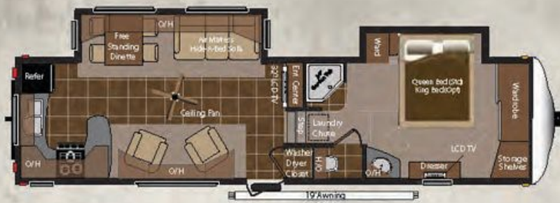
3000RK BIG SKY PACKAGE ELIGIBLE