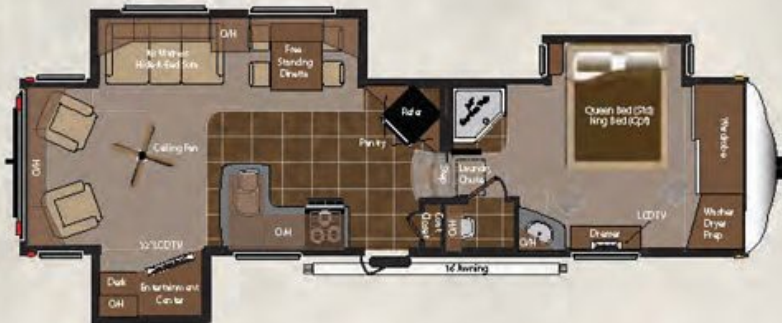
3150RL BIG SKY PACKAGE ELIGIBLE