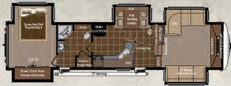
3750FL BIG SKY PACKAGE ELIGIBLE