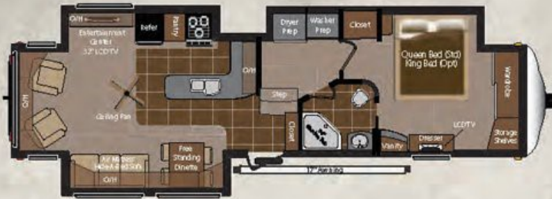
3700RL BIG SKY PACKAGE ELIGIBLE