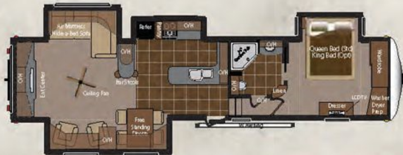
3625RE BIG SKY PACKAGE ELIGIBLE