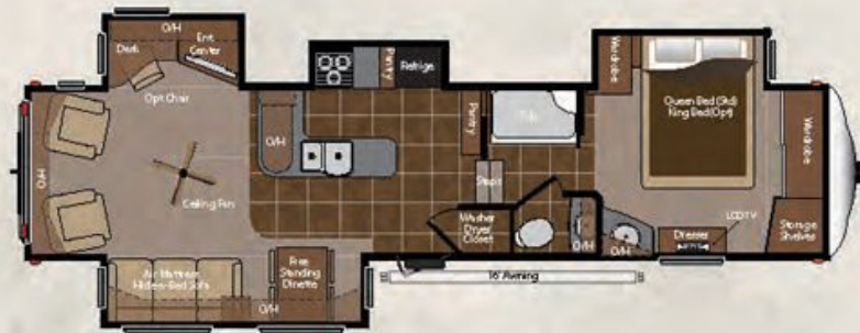
3402RL BIG SKY PACKAGE ELIGIBLE