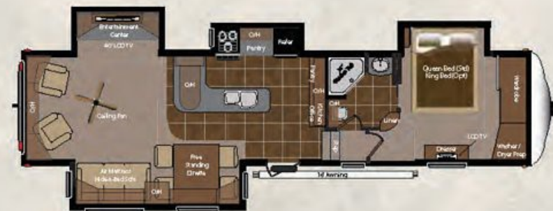
3455SA BIG SKY PACKAGE ELIGIBLE