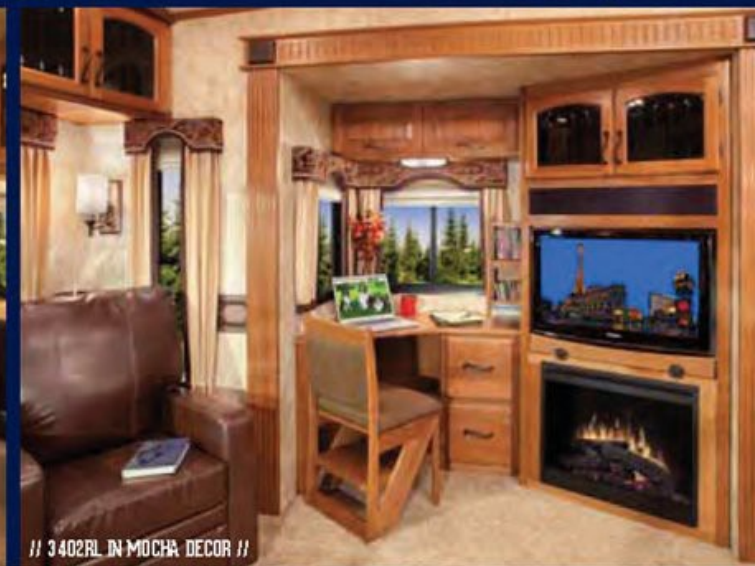
// 3402RL IN MOCHA DECOR //

SO WHY SETTLE FOR ANYTHING LESS THAN THE BEST?