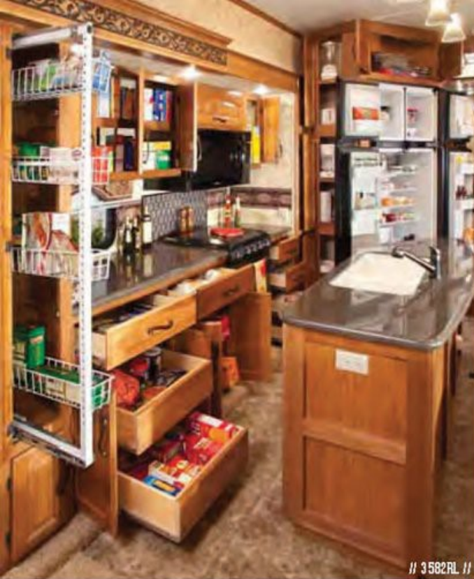
// 3582RL //