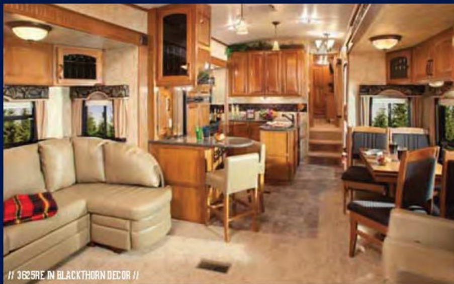
// 3625RE IN BLACKTHORN DECOR //

Montana // 3625RE IN BLACKTHORN DECOR //