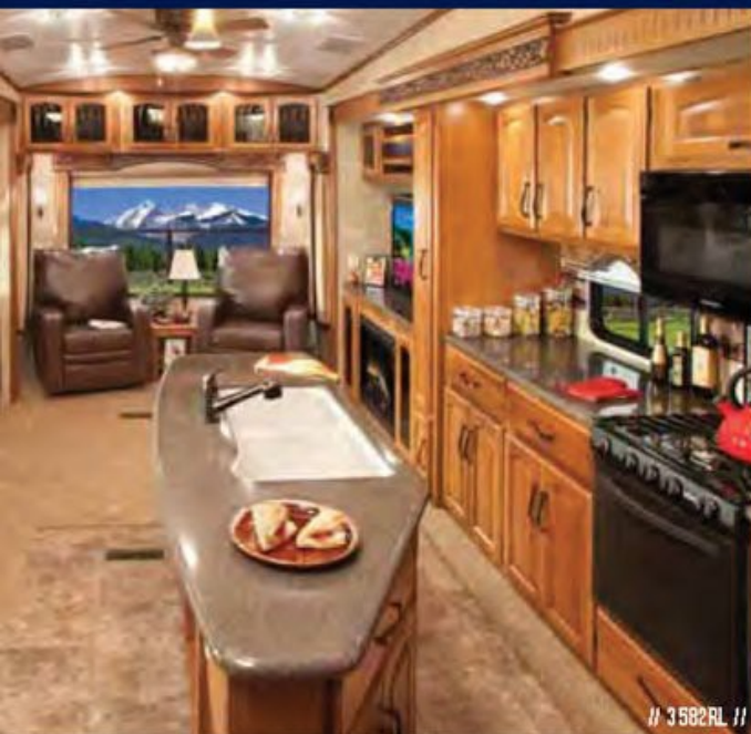
// 3582RL //

The new 3582 RL offers storage solutions you would not think possible in a triple slide fifth wheel thanks to opposing full wall slide-outs and a free standing kitchen island.